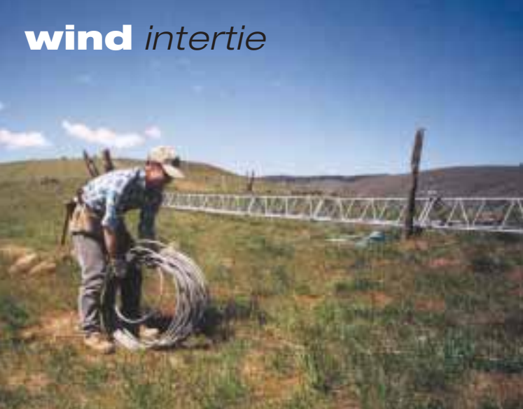
Rolling out the guy wires.

it with sand and caution tape before backfilling the hole. Conduit with ground wire running outside it will be Randy's preferred method next time. Three, #2 (33 mm 2 ) transmission wires and a #8 (8 mm 2 ) copper ground wire were run 924 feet (281 m) from the tower base to the inverter.