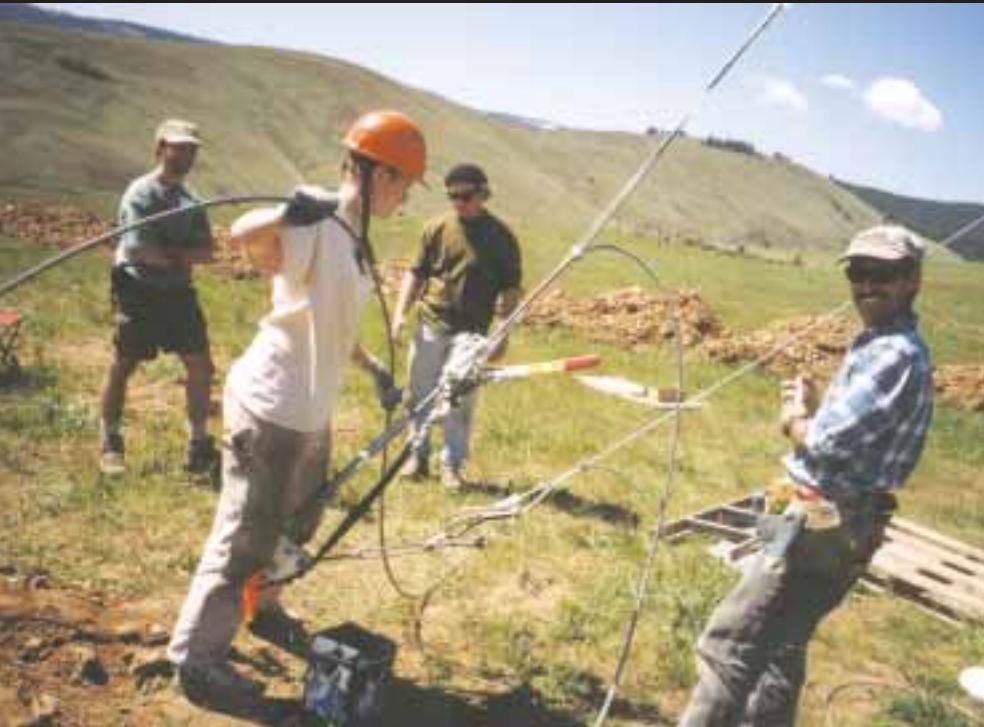
Tensioning the guy wires and plumbing the tower.

crane to make a straight-up lift without reaching too far out, which limits how much weight the crane can lift. The crane dragged the base until the whole assembly was vertical.