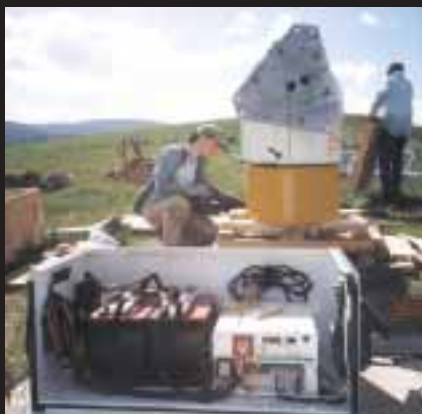
Portable power runs tools on the site.

Later, after the trench to the power shed had been dug, Randy noticed that there was no topsoil on the ridge at the turbine site, but several feet of topsoil down by the shed. Also, the wildflowers and sage on the southeast sides of the hills in this high desert area were robust, while there was stunted vegetation on the ridge at the turbine site. All these subtle indications, combined with Charlie Nichols' experience in this country, pointed to the likelihood of consistent winds on the ridge.