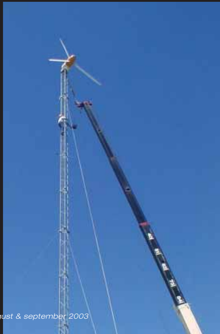
Climbing to unhook the crane.

Chelan County PUD responded quickly and arrived Friday morning to connect the approved system to the grid. After connection, grid voltage was checked and the inverter was turned on. The system started flawlessly and became the first grid tied wind turbine in Chelan County, and the first wind turbine to supply