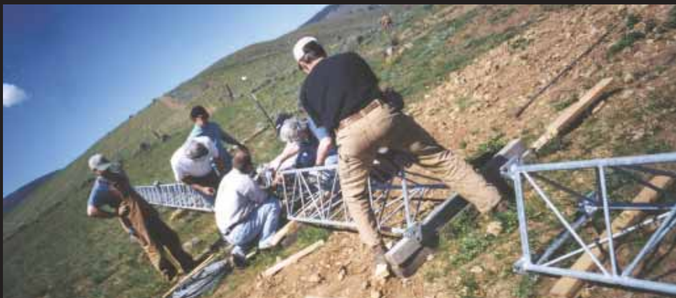
Laying out and bolting together the ten, 10 foot tower sections.

The proposed turbine location had no trees to check for wind flagging. Older wind resource maps indicated that the exposed ridge experienced class 4 winds (13.4–14.5 mph; 6.0–6.5 m/s average) and newer maps indicated class 3 winds (12.3–13.4 mph; 5.5–6.0 m/s average). But both are mathematical extrapolations that might not define the site's actual microclimate. June and Charlie decided to forgo potentially sophisticated (expensive) wind measurements and follow their gut by putting up the Excel.