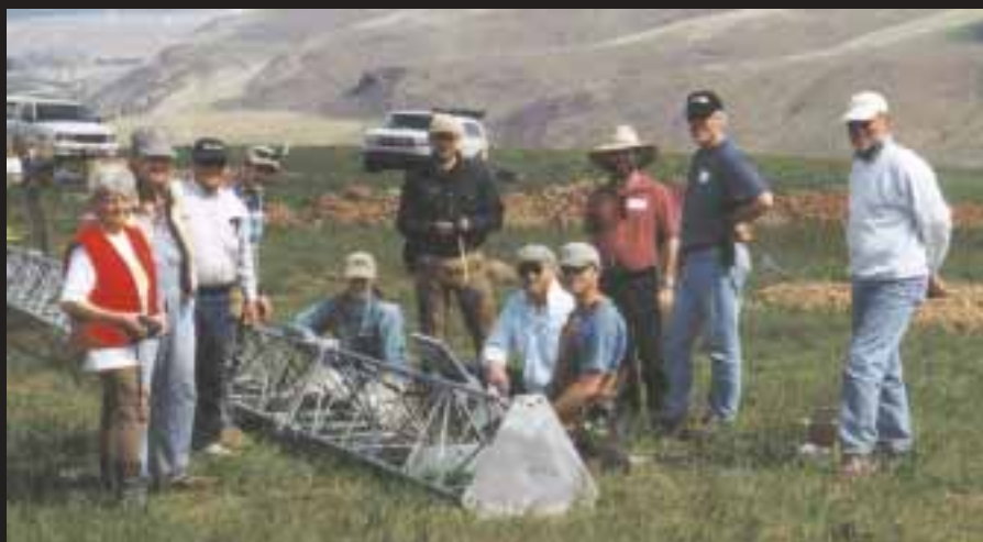
The hard-working crew pauses for a group photo.