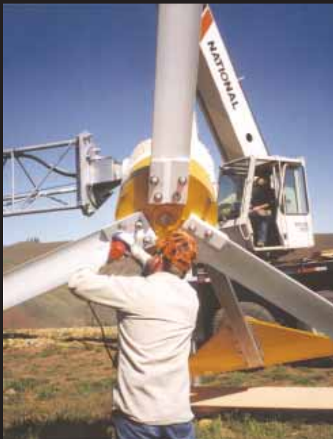
Mounting the blades using an impact wrench.

the first cut of a Bergey installation video, and mentioned updates both to it and the installation manual.