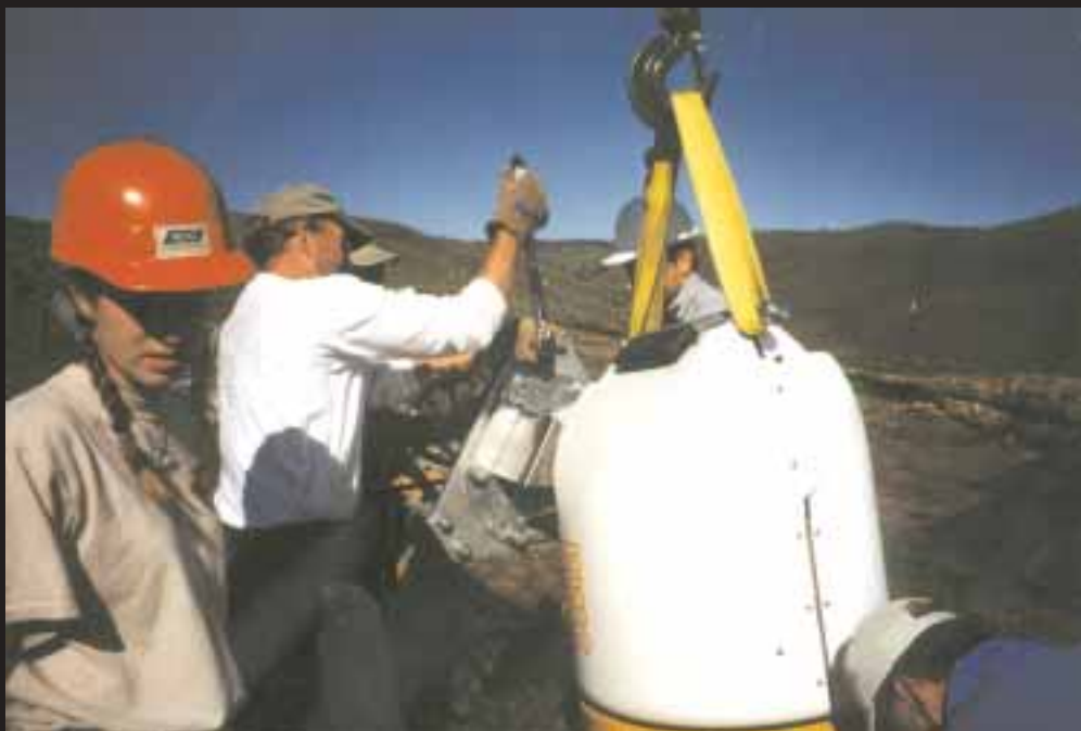
The crane holds the weight while the Bergey Excel is bolted to the tower top.

It was thought that direct burial electrical wire would be best to use. But after doing it, Randy decided that it was not worth the extra labor to fill in the rocky sections of the trench with sand, and then lay the wire and cover