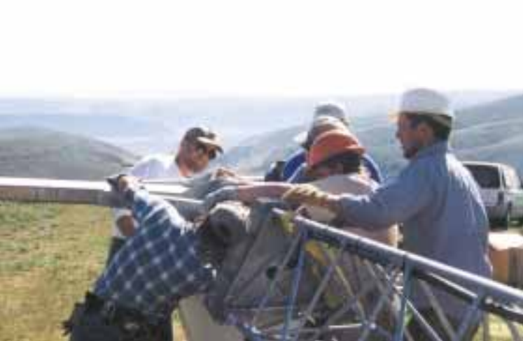
Muscling the Bergey's tail into position.