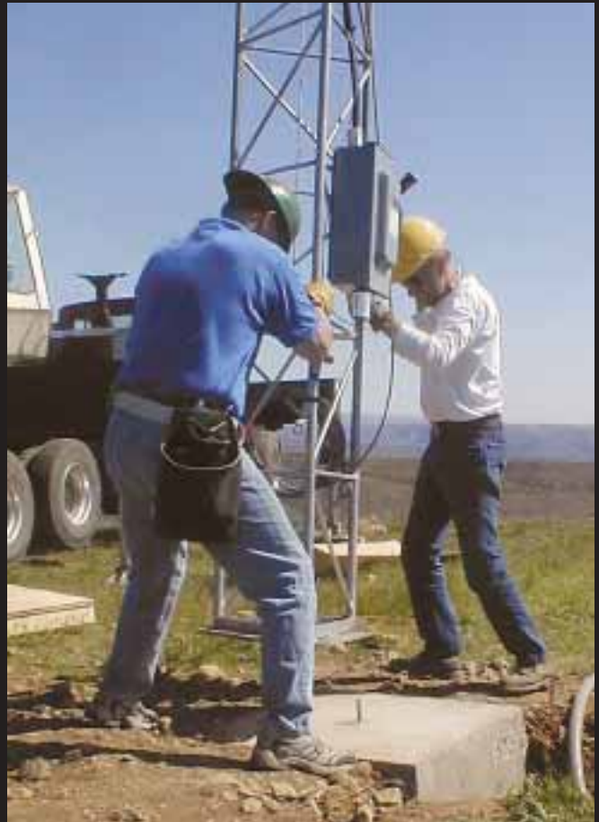
Putting the base in place.

The strap from the crane was attached at 80 feet (24 m). The position of the assembled tower and crane allowed the