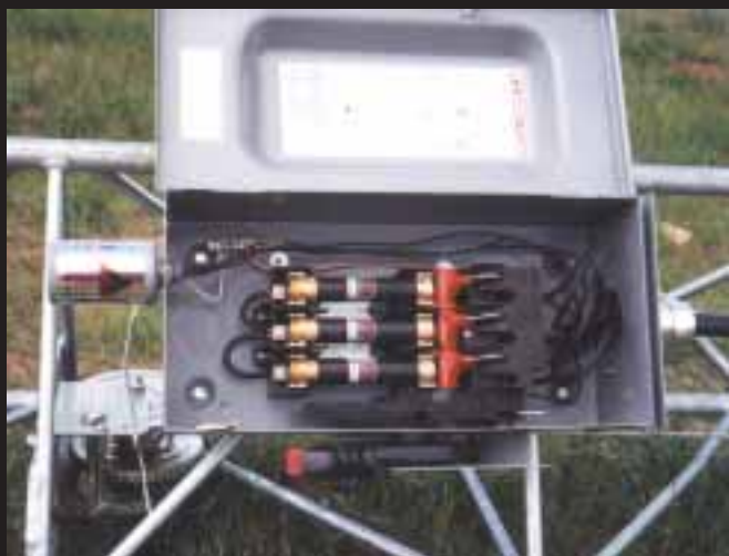
Overcurrent protection at the tower's base.