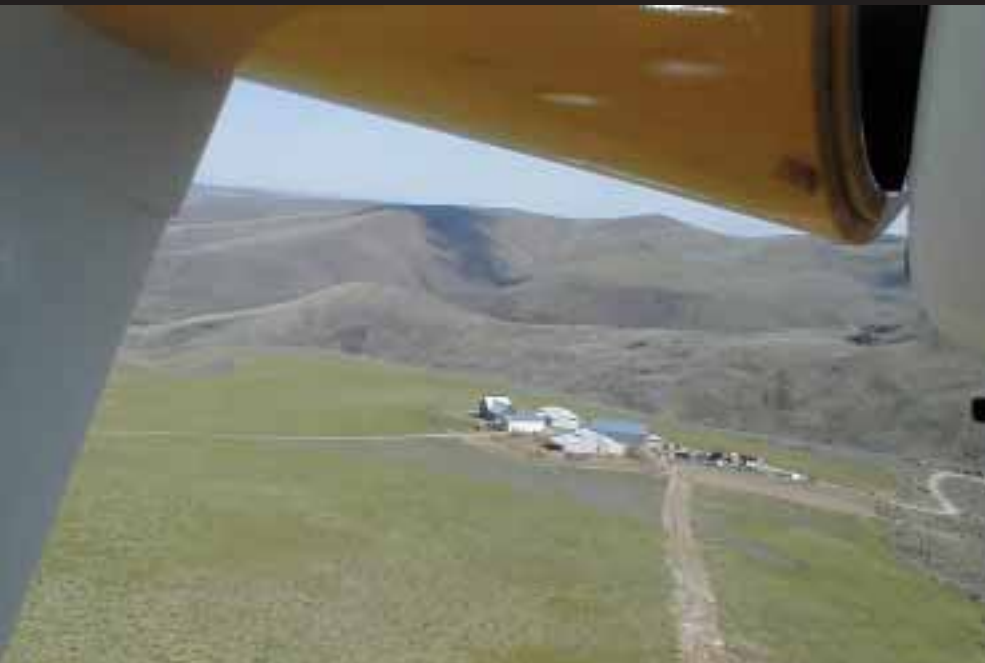
The Nichols' ranch as seen from 100 feet up.

State. She obtained a state tax number and registered as a business to qualify as part of the SNAP program.