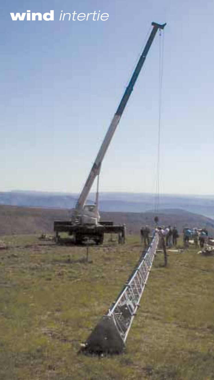
Ready to raise.

we had to wiggle the sections and use drift pins to get all the holes to line up to connect the sections.